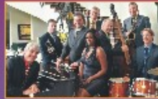
SIDE STREET STRUTTERS