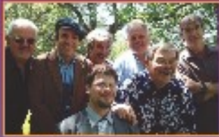
WALLY'S WAREHOUSE WAIFS