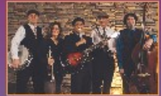
BIG BUTTER JAZZ BAND