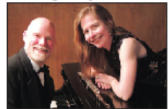
ivory & gold