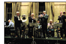
yerba buena stompers