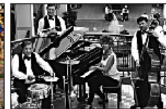
canUS jazz band