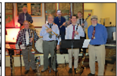
evergreen jazz band